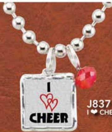
J837 I ♥ CHEER